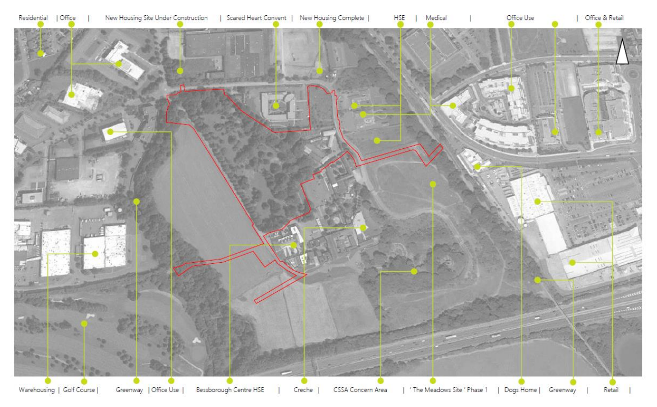
Figure 1.1 Site Context

The majority of the site is within the 'Landscape Preservation Zone' zoning use in an area that is described in the Mahon Local Area Plan as a 'key development area', with a small infrastructure element running around the south and west of the zoning. There has been significant change in this area over recent years through the development of the N40 South Ring Road, Mahon Point Shopping Centre and Retail Park, City Gate, Lough Mahon Technology Park and Mahon Industrial Estate, in addition to various residential developments particularly in nearby Jacobs Island. It is an area where further residential development is planned and anticipated in the future.